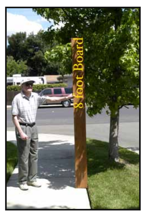
These bushes are too low - 8' clearance is needed

Residents who live near street lights, stop signs, and fire lane signs should check their shrubs and trees to make sure the street light and signs are not obstructed. Also, for the benefit of tall people please remember that branches overhanging sidewalks should be trimmed 8' or higher above the sidewalk and 10' or higher above the street and gutter to allow recycling truck and street sweeper access.